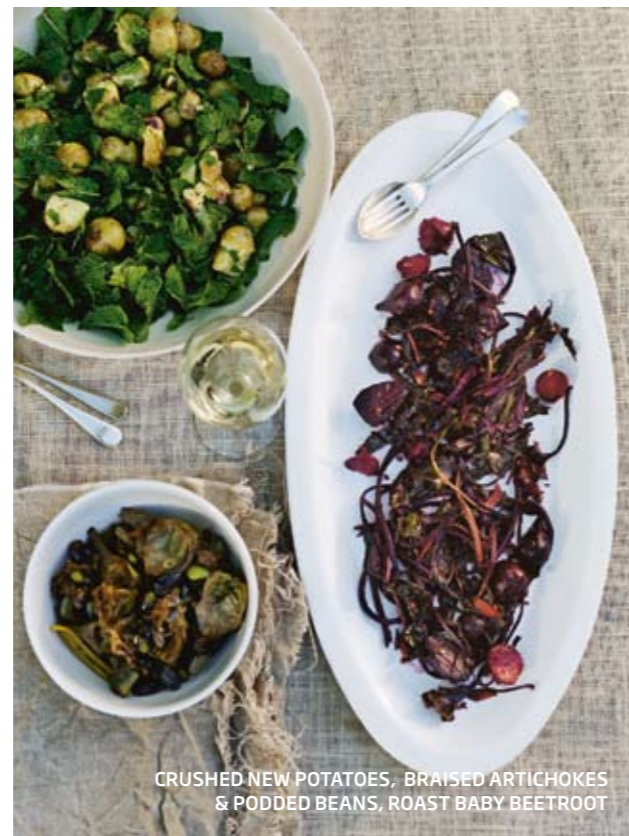
CRUSHED NEW POTATOES, BRAISED ARTICHOKE & PODDED BEANS, ROAST BABY BEETROOT

Per serving 339 cals, 0.4g fat (0.0g saturated), 1.1g protein, 82.5g carbs, 82.2g sugars