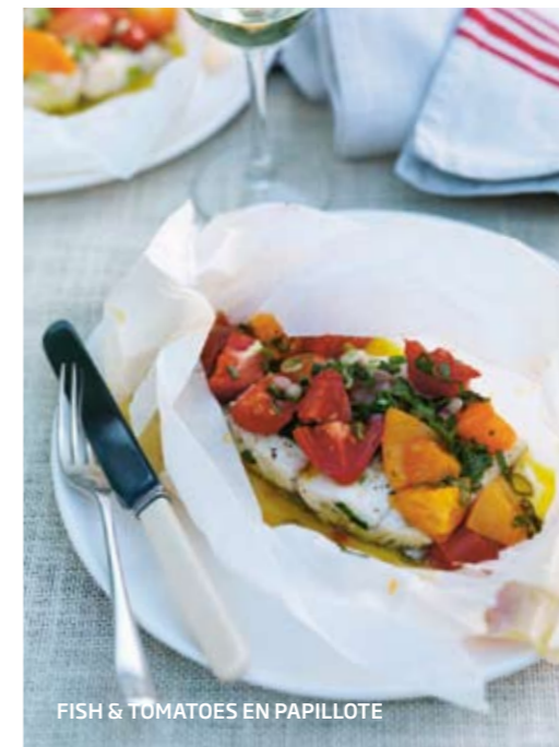
FISH & TOMATOES EN PAPILOTTE

1 Peel the artichokes back to their pale leaves, halve them and remove the hairy chokes with a teaspoon. Immerse the artichokes in water with lemon juice or vinegar to prevent browning. 2 Heat the olive oil in a deep saucepan over a medium heat. Add onion and garlic and sauté gently for 8 minutes, until the onion is soft and translucent. Season with sea salt, then add the beans and prepared artichokes. Cover and simmer gently for 15–20 minutes, until the beans and artichokes are very tender. Add herbs, adjust seasoning with salt and black pepper, then serve with lemon wedges, if desired. Per serving 595 cals, 51.2g fat (7.7g saturated), 15.3g protein, 18.2g carbs, 9.8g sugars