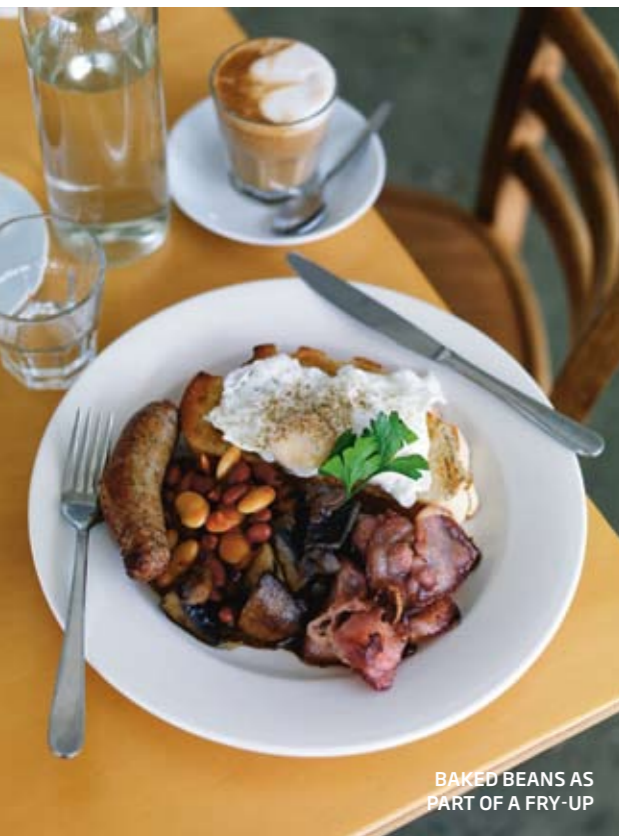
BAKED BEANS AS PART OF A FRY-UP