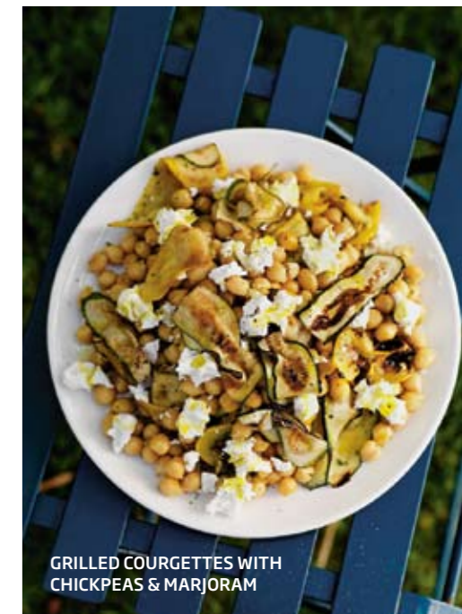
GRILLED COURGETTES WITH CHICKPEAS & MARJORAM

1 Preheat the oven to 180C/gas 4. Remove the beetroot tops, wash and set aside. Wash the beetroots and divide among three pieces of aluminium foil. Drizzle with a little olive oil, season with salt and pepper and tightly wrap. Roast for 30–50 minutes, depending on the size of the beetroots, or until tender. Remove and allow to cool enough to handle. Peel beetroots and set aside. 2 Sauté the onion, garlic and a pinch of salt in extra-virgin olive oil in a large frying pan over a medium heat for 8–10 minutes or until beginning to caramelize. Add the spices and cook until fragrant, then add the reserved