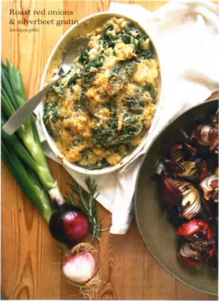
Roast red onions & silverbeet gratin (recipe p16)