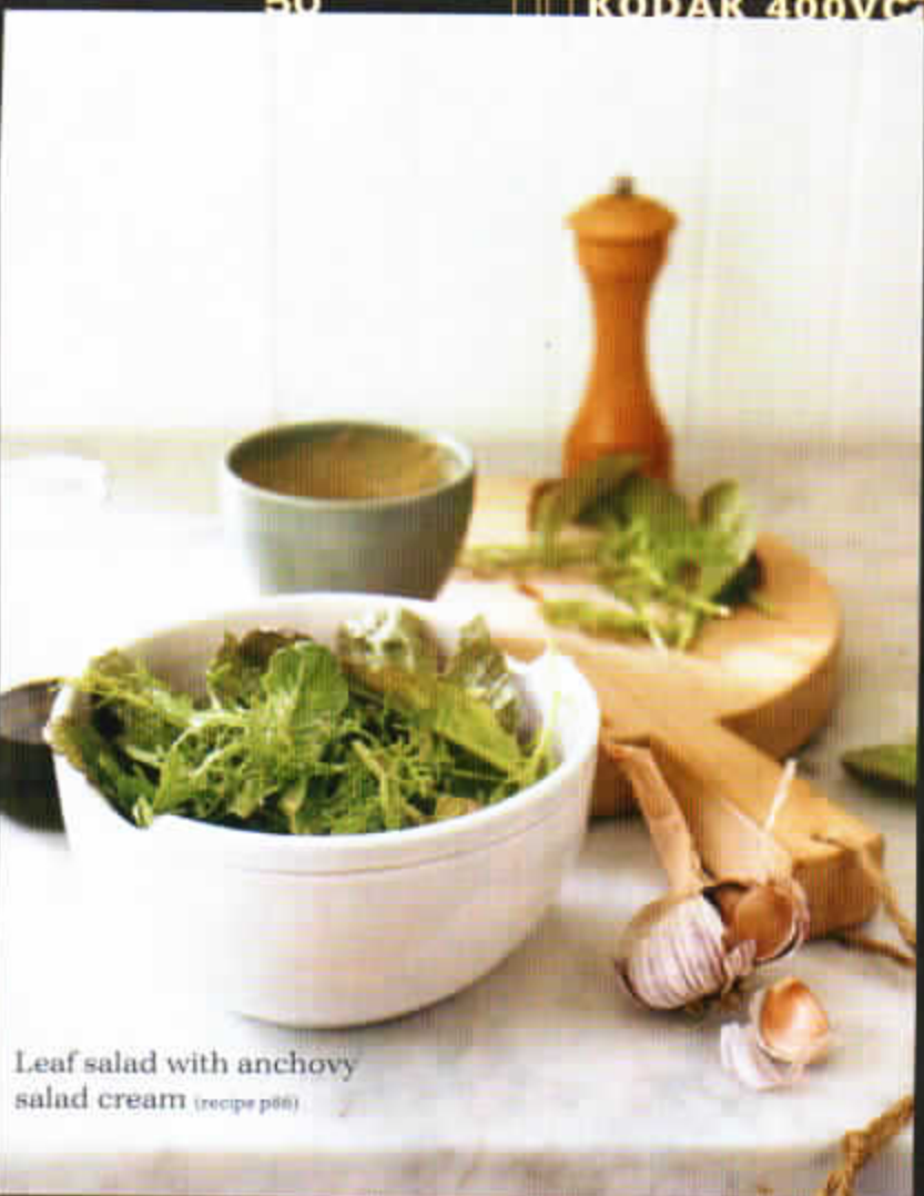
Leaf salad with anchovy salad cream (recipe p16)

Grace the family dining table with tender roast pork capped by a satisfying amount of crackling.