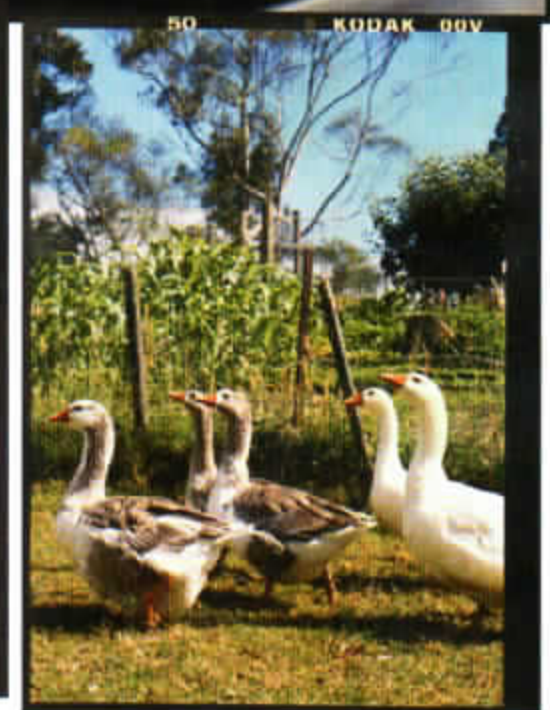
"The zucchini have gone crazy... the geese are biding their time... the cows are being a nuisance."