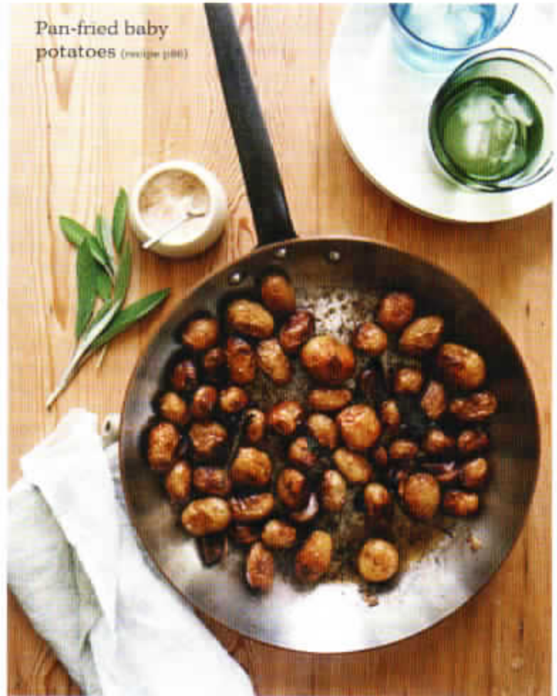
Pan-fried baby potatoes (recipe p16)

The Agrarian Kitchen. wholewheat pasta with almonds, parsley & homemade ricotta Roast Wessex Saddleback loin Silverbeet gratin + roast red onions Pan-fried baby potatoes + green salad with anchovy salad cream Peach & raspberry crumble