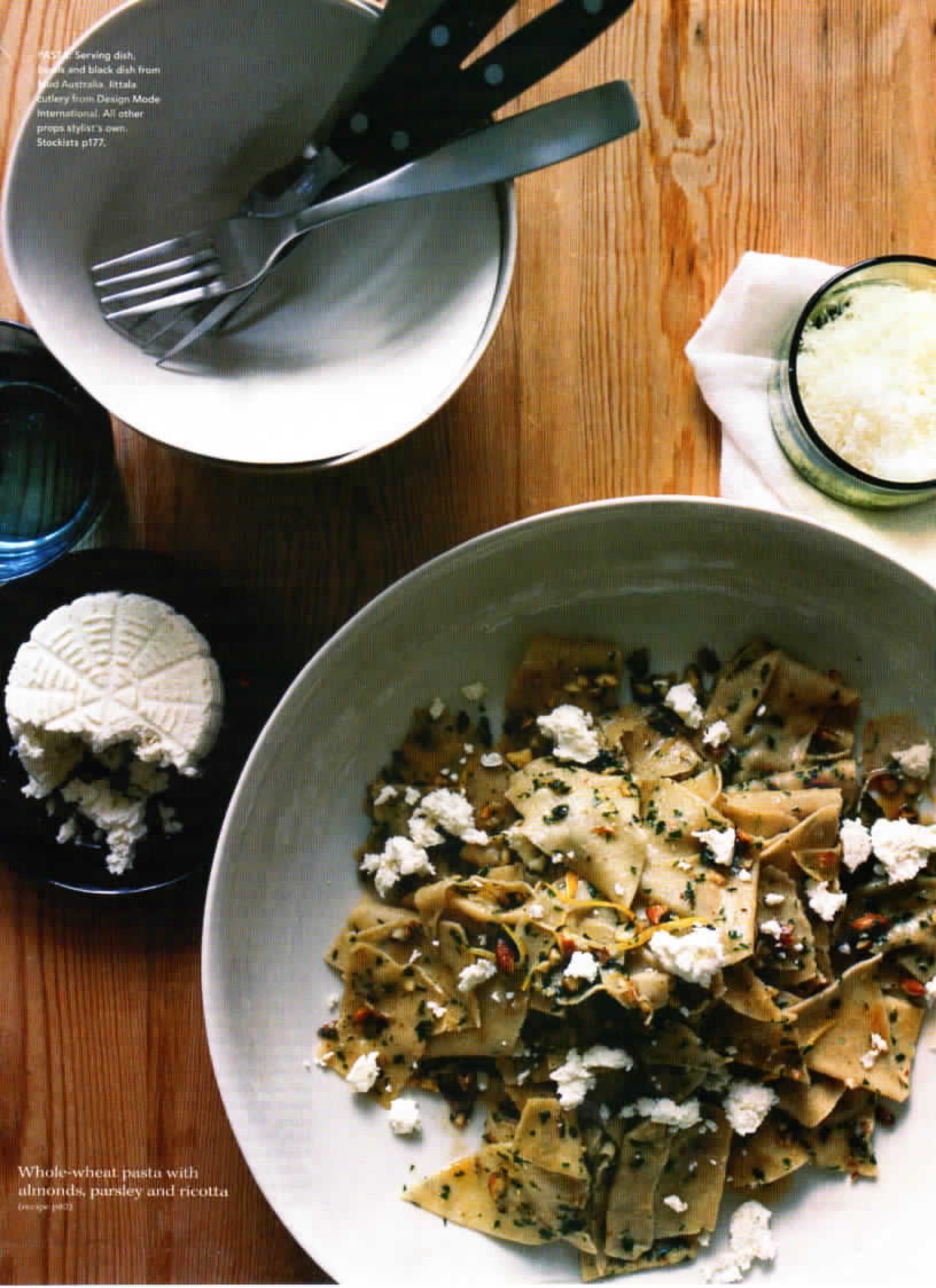
Whole-wheat pasta with almonds, parsley and ricotta (recipe p83)

9522 Serving dish, black and black dish from Mid Australia. Iittala cutlery from Design Mode International. All other props stylist's own. Stockists p177.